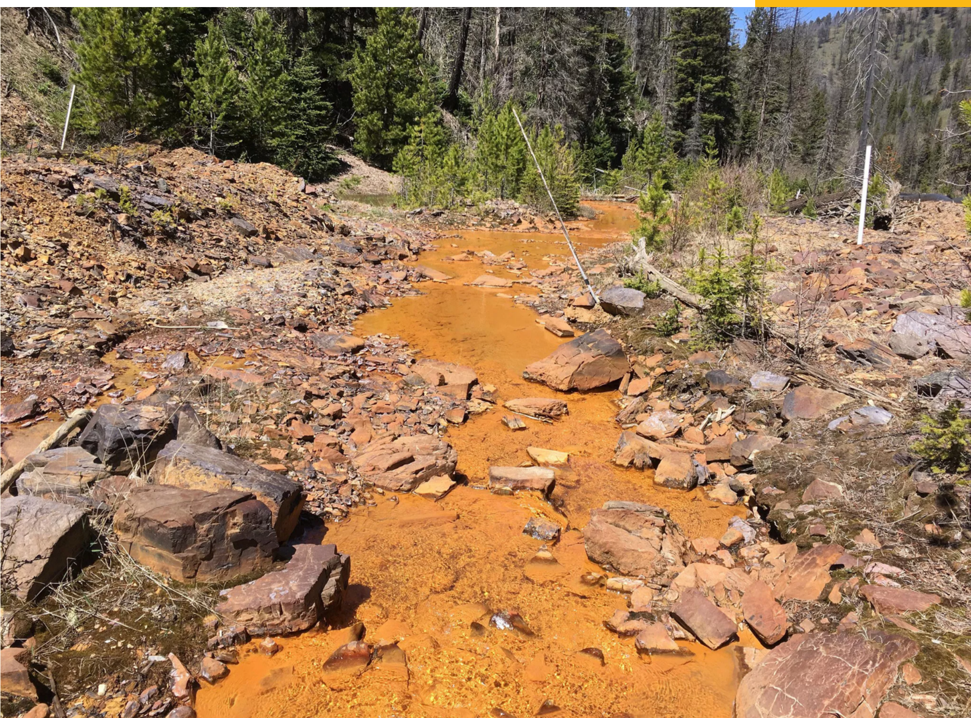
Pictured: Acid mine drainage from the Mike Horse Mine complex enters upper Blackfoot River watershed. These defunct mines are owned by ASARCO and ARCO, with clean-up operations occurring through State Superfund program. Water treatment will be required in perpetuity.

Acid mine drainage is one of mining's most serious threats to water. A mine draining acid can devastate rivers, streams, and aquatic life for hundreds, and under the “right” conditions, thousands of years.